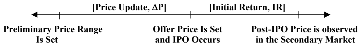
Fig. 1. Time-line for the IPO Pricing Process

To examine the biases in the pricing of IPOs, we obtain data on all firms that went public between 1985 and 1999 from the Securities Data Corporation (SDC). Unit IPOs, closed end funds, real estate investment trusts (REITs), and American Depositary Receipts (ADRs) are excluded. Section 2.1 defines our IPO pricing measures as well as the explanatory variables that we use in our empirical tests. Section 2.2 investigates the issue of sample selection, which potentially affects our empirical analysis.