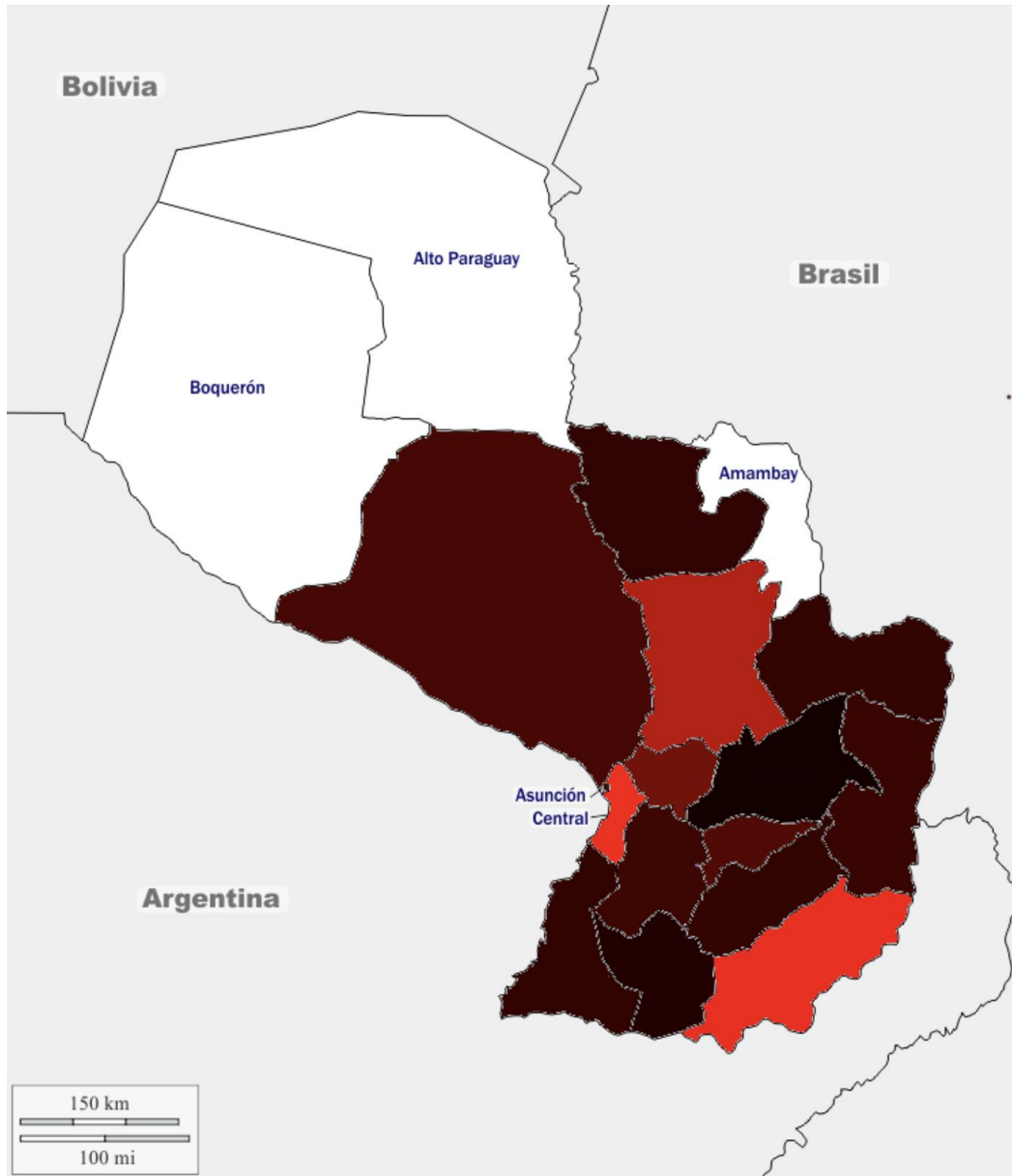
Figure B1. The departments show the distribution of beneficiaries across departments. Departments in brighter red represent those with the highest share of beneficiaries and those with darker shade the lowest share (Share ranged from 1 to 20 percent). The departments of Boquerón, Alto Paraguay, and Amambay were not sampled because less than 1 percent of the beneficiary population resided in these departments.

This appendix includes a map showing the location of beneficiaries in the country.