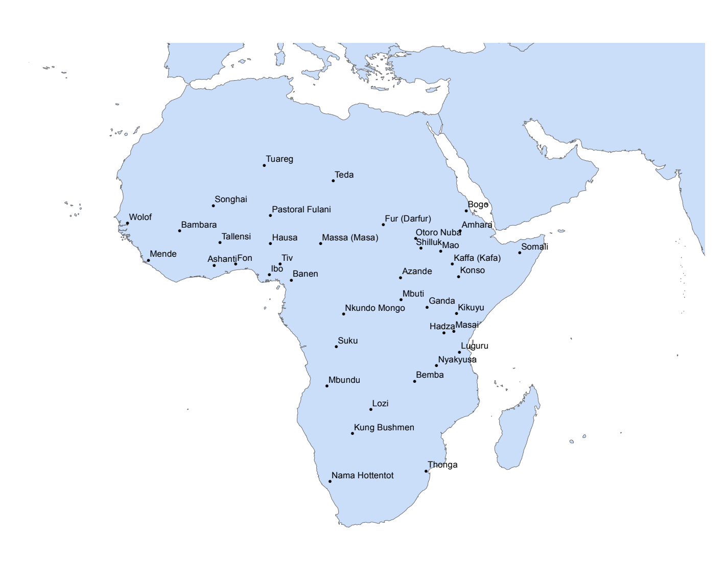
Figure 2: African Ethnic Groups (sub-Sahara) in SCCS Dataset.