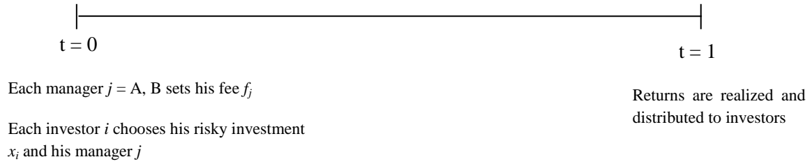
Figure 1: Timeline

At t = 0 , the two money managers compete in fees to attract clients. Each manager j = A, B optimally chooses what fee f_j to charge per unit of assets managed. Based on the fees simultaneously set by managers, each investor optimally decides how much to invest in the risky asset and under which manager. At t = 1 , returns are realized and distributed to investors.