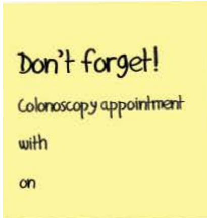
Figure 2. Experimentally varied reminder mailers sent to study participants.