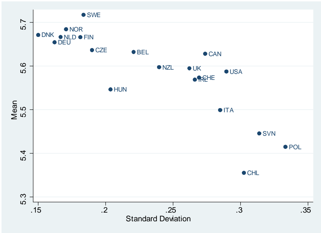
Figure 1: Mean and Dispersion in IALS log-scores (1994-1998)