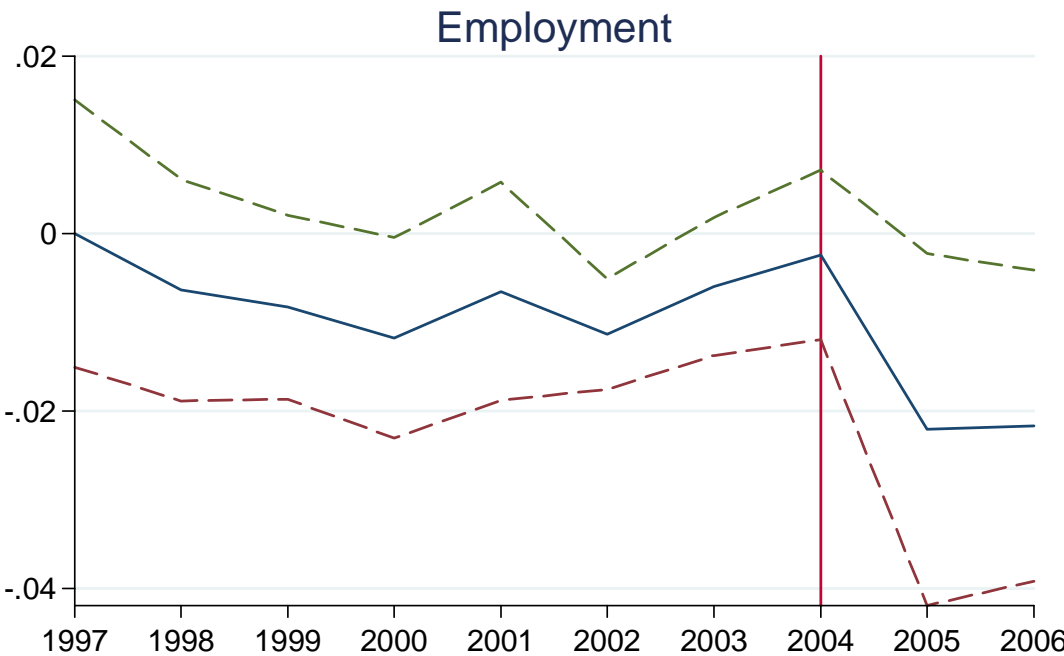
Figure 1: Employment and Wages of Chavez Opponents (relative to non-signers), Venezuela Household Surveys 1997-2006