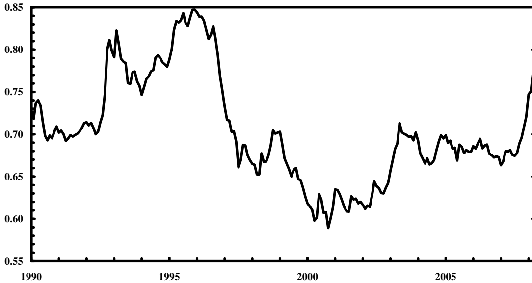
Figure 1. U.K./euro area exchange rate, 1990–2008 (pound sterling received per euro)